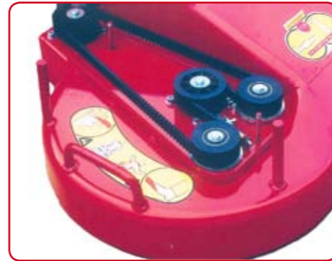
Double-sided timing belts on the deck of grass cutting equipment

All over the country workers involved in the horticultural industry are preparing grass cutting equipment ready for the coming season—now is the time to stock up on the belts these machines use.