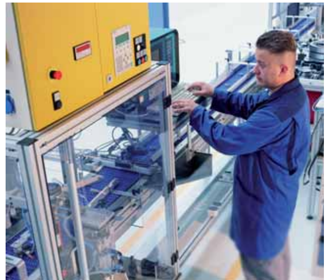
100% noise testing guarantees highest precision.