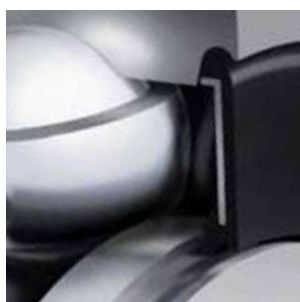
The newly developed NKE double-lip labyrinth seal